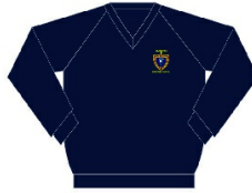
Woollen Jumper from $ 72.00