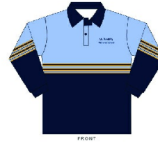
Rugby Top $ 87.50