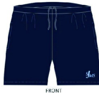
Sport Shorts $ 30.00