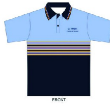
Sports Polo $ 59.00