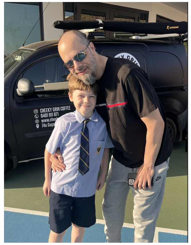
CATHOLIC SCHOOLS MUSIC FESTIVAL