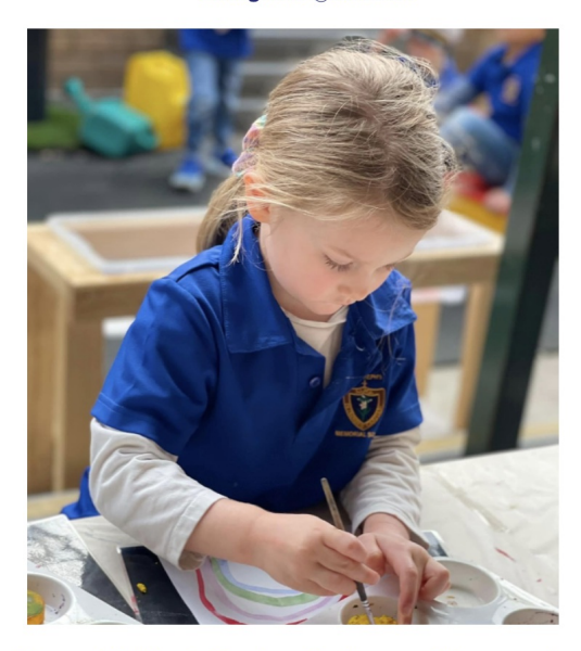
Your child is at the heart of everything we do

Website: www.sjms.catholic.edu.au Facebook: www.facebook.com/SJMSSA Instagram: @SJMSSA