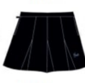
Skirt (Culottes) $63.00