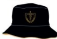
Reversible Bucket Hat Yellow - $18.00