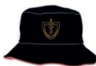
Reversible Bucket Hat Red - $18.00