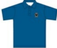
Pre School Polo $27.00