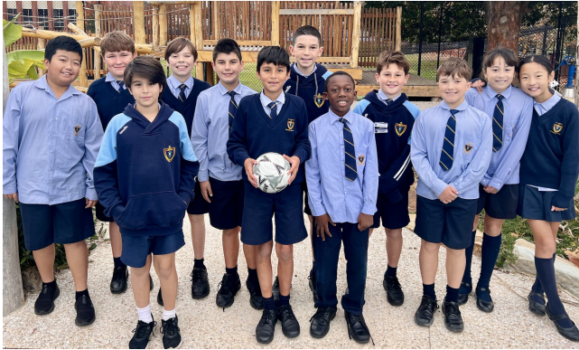
Our Year 5/6 Soccer team