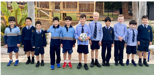
Our Year 2 Soccer team

From all reports, our school teams have been enjoying playing games after school throughout the week and on the weekend. It is wonderful to hear about and see the students representing the school with a positive attitude and enjoying having fun with their peers. Thank you, and well done, to all the parent coaches who guide and lead the teams with great care and effort.