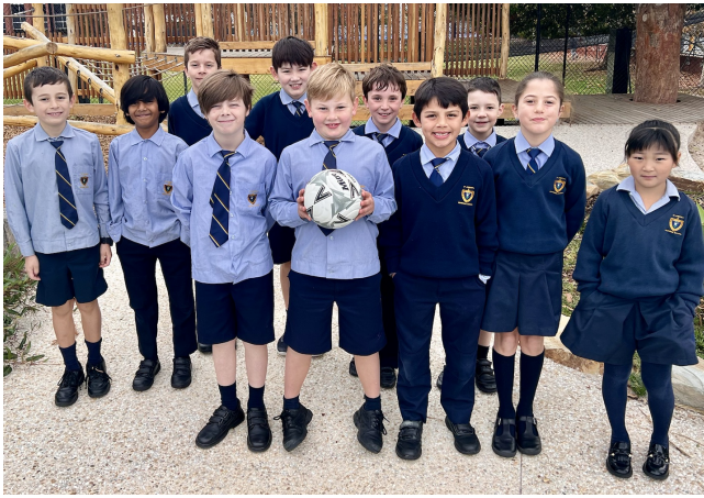
Our Year 3/4 Soccer team