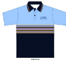
Sports Polo $ 59.00