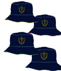
Reversible Bucket Hat $ 18.00