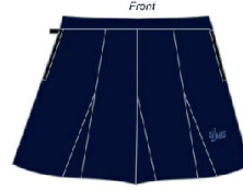
Skirt - Culottes $ 63.00