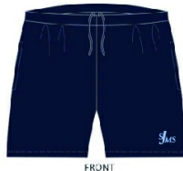
Sport Shorts $ 30.00