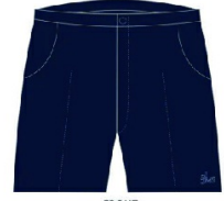
Elastic Back Shorts $ 39.00