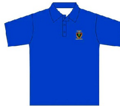
Pre School Polo $ 27.00