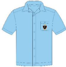
Short Sleeve Shirt $ 48.00