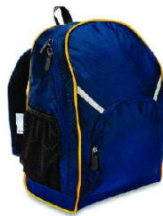
Back Pack $ 62.00