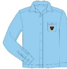
Long Sleeve Shirt $ 49.00