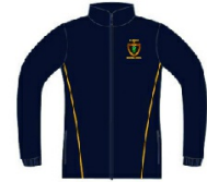
Softshell Jacket $ 86.50