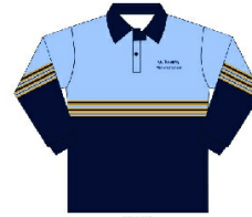
Rugby Top $ 87.50