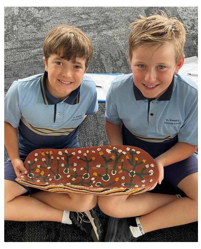
Bridge Street Library, Hall, and OSHC Building Update

The refurbishment project of the Bridge St Library, Hall, and OSHC is nearing completion, with the flooring, painting, and joinery almost finished. We can't wait for the students to use this space.