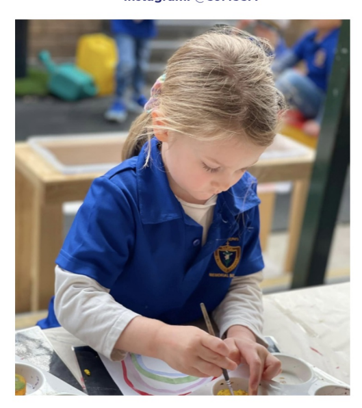
Your child is at the heart of everything we do

Website: www.sjms.catholic.edu.au Facebook: www.facebook.com/SJMSSA Instagram: @SJMSSA