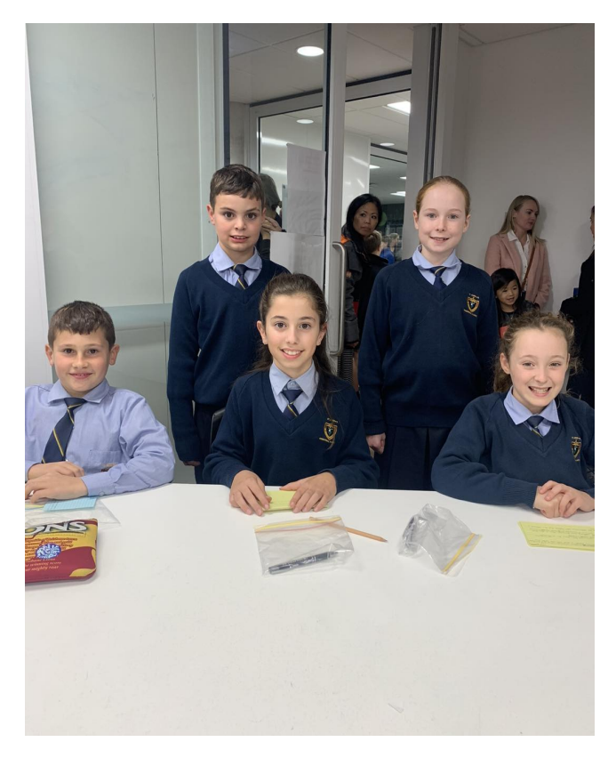
Year 5 Debating Team