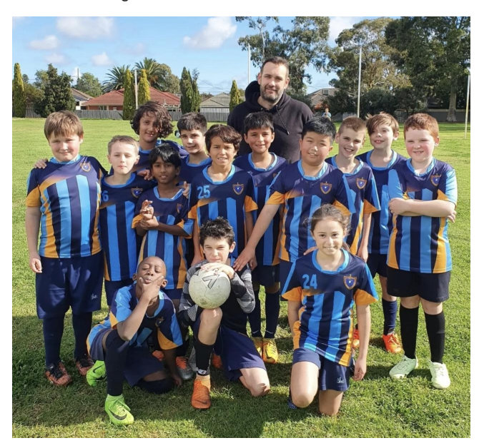
Year 4/5 Soccer Team