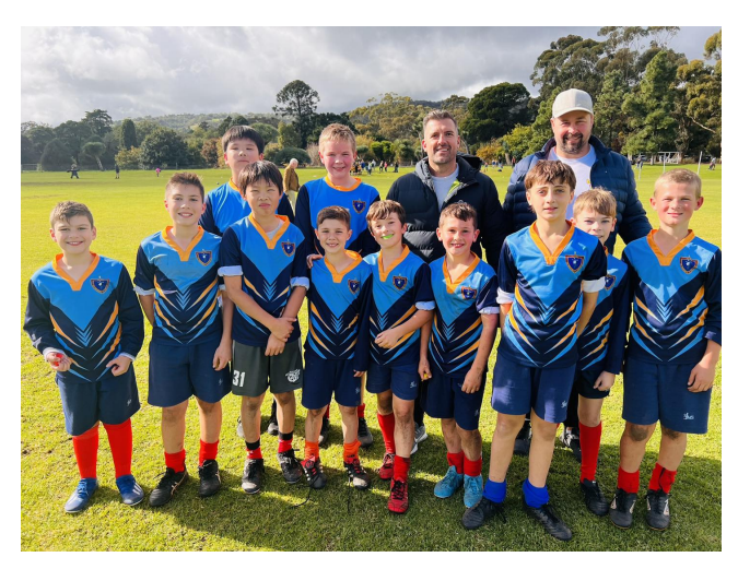
Year 4/5/6 Football team