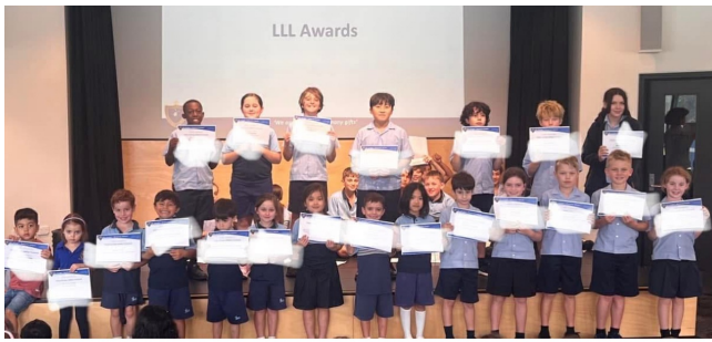
Year 6 Assembly & Live, Learn, Lead Awards