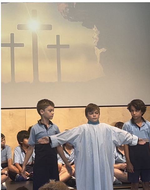
At the end of Holy Week, students visited the Norwood Parish for our Year 5 and 6 students to engage in a prayerful, guided journey through the Stations of the Cross. Students from all classes contributed artwork to depict each station.