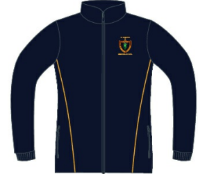
Softshell Jacket $82.00