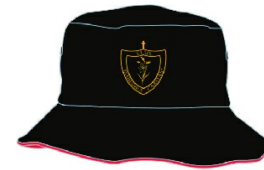
Reversible Bucket Hat Red - $18.00