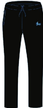
Track Pants $41.00