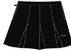
Skirt (Culottes) $63.00