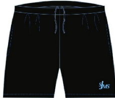
Sports Shorts $30.00