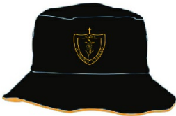
Reversible Bucket Hat Yellow - $18.00