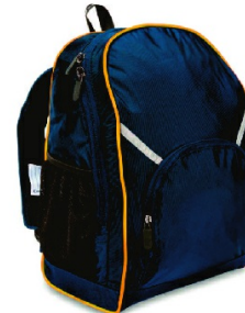
Back Pack $61.00