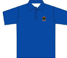
Pre School Polo $27.00