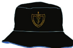
Reversible Bucket Hat Blue - $18.00