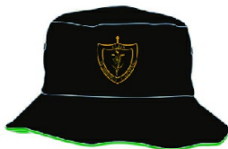
Reversible Bucket Hat Green - $18.00