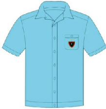
Short Sleeve Shirt $48.00