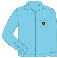
Long Sleeve Shirt $49.00