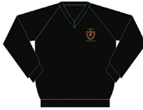
Woollen Jumper $72.00