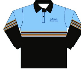
Rugby Top $79.00