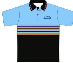
Sports Polo $56.00