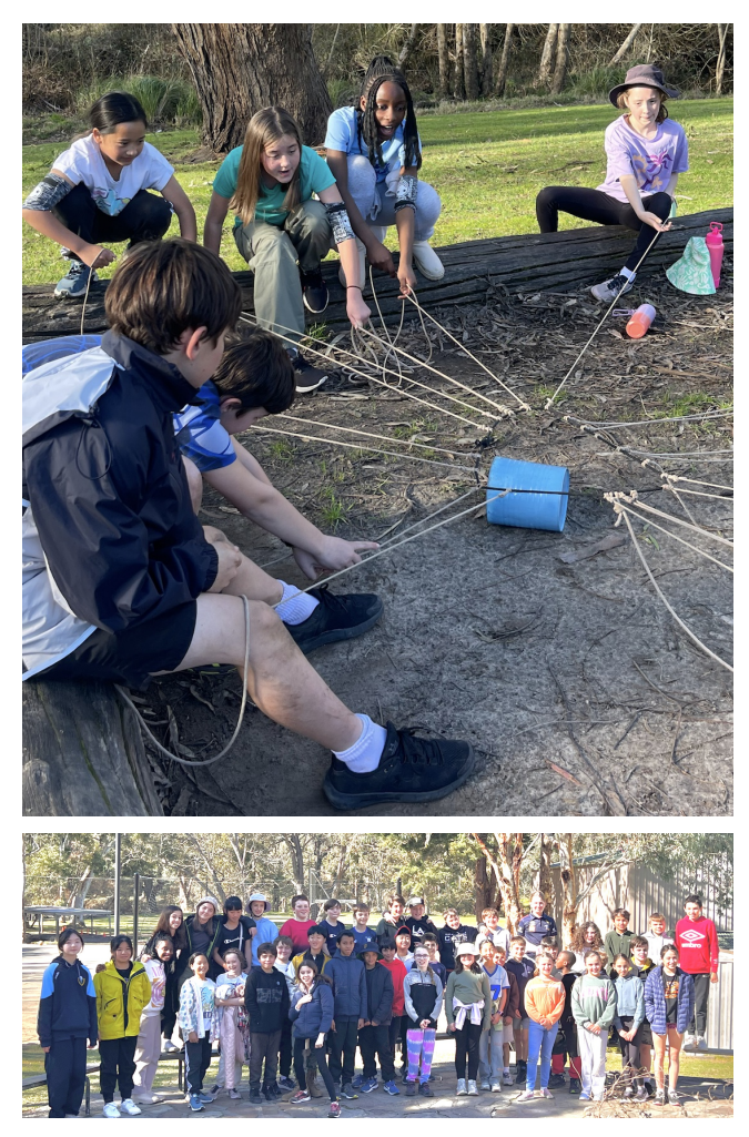
GRANDPARENTS: GRAND FRIENDS DAY

This week our Year 5 to 6 students attended camp at Mylor. This was an opportunity for the students to learn outside of the classroom to build stronger connections, develop collaborative group skills, try new things, build resilience, and learn in new ways. Thank you to the incredible teachers for leading the students through the activities and ensuring each student had valuable and enriching time away.