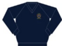
St Joseph's Norwood | Woollen Jumper