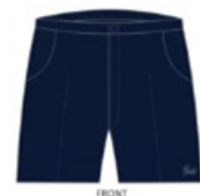
St Joseph's Norwood | Elastic Back Shorts