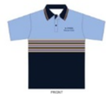
St Joseph's Norwood | Sports Polo