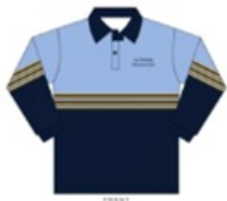
St Joseph's Norwood | Rugby Top