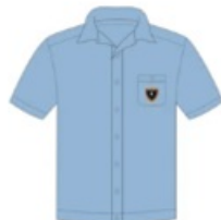
St Joseph's Norwood | Banded Shirt - Short Sleeve