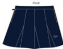
St Joseph's Norwood | Skirt (Culottes)