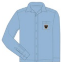
St Joseph's Norwood | Banded Shirt - Long Sleeve